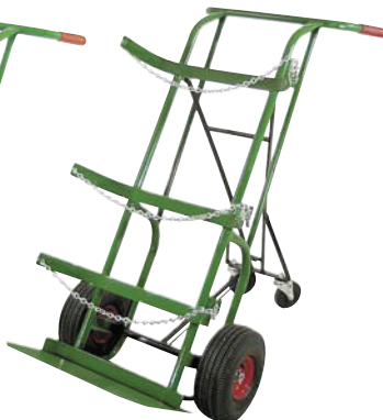
NO. 55PN-3B-FRA HEIGHT: 48" WIDTH: 25" (O.D.) WEIGHT: 49 lbs.

STATIONARY BACK ASSEMBLY WITH LARGE 4" REAR CASTERS.