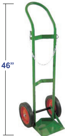
NO. 6110 HEIGHT: 46" DEPTH: 15" (O.D.) WIDTH: 15" (O.D.) WEIGHT: 23 lbs. WHEEL DIA: 10" x 1.75" SOLID RUBBER (BB) SINGLE CYLINDER