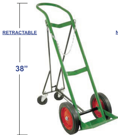
NO. 6114 HEIGHT: 46" DEPTH: 15" (O.D.) WIDTH: 15" (O.D.) WEIGHT: 30 lbs. WHEEL DIA: 10" x 1.75" SOLID RUBBER (BB) CASTER: 4" x 1" SWIVEL / POST SINGLE CYLINDER

Large, easily replaceable, 4" swivel casters on all rear wheel retractable and stationary models.