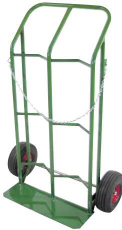
NO. 55PN HEIGHT: 48" WIDTH: 33" (O.D.) WEIGHT: 54 lbs.

WHEEL TYPE: 10" x 2.75" SOLID RUBBER (BB)