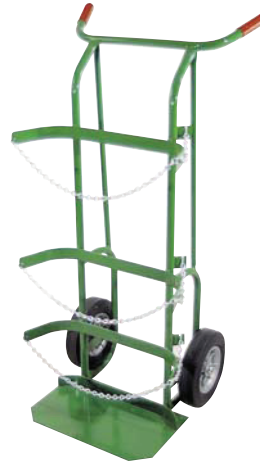
NO. 55-3B HEIGHT: 48" WIDTH: 21" (O.D.) WEIGHT: 38 lbs.

WHEEL TYPE: 10" x 2.75" SOLID RUBBER (BB)