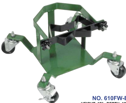
NO. 610FW-E HEIGHT: 12" DEPTH: 18" (O.D.) WIDTH: 18" (O.D.) WEIGHT: 24 lbs.

The 610FW-E and 610FW-H are newly modified (by popular demand) with removable heavy-duty 3" x 1.50" rubber tired (125 lb.ea. L/R) casters for easier rolling over carpets and in and out of elevators.