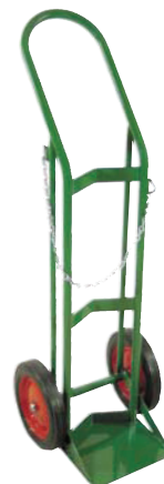
NO. 63D HEIGHT: 46" DEPTH: 15" (O.D.) WIDTH: 15" (O.D.) WEIGHT: 27 lbs. WHEEL DIA: 10" x 1.75" SOLID RUBBER (BB) SINGLE CYLINDER