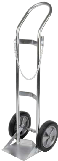
NO. 6110-CRU HEIGHT: 46" DEPTH: 15" WIDTH: 15" WEIGHT: 23 lbs. WHEEL DIA: 10" SEMI. PNEU. SINGLE CYLINDER

CHROME PLATED FRAME WITH LARGE NON-MARRING 10" RUBBER / PLASTIC WHEELS