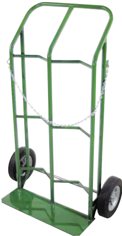
NO. 55 HEIGHT: 48" WIDTH: 29" (O.D.) WEIGHT: 55 lbs.

WHEEL TYPE: 10" x 2.75" SOLID RUBBER (BB)