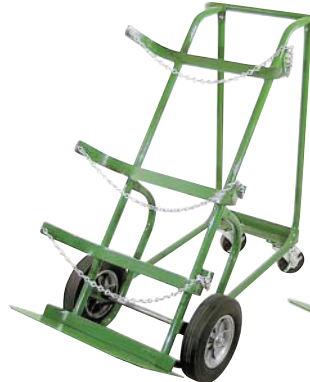
NO. 55-3B-SA HEIGHT: 48" WIDTH: 21" (O.D.) WEIGHT: 55 lbs.

WHEEL TYPE: 10" x 2.75" SOLID RUBBER (BB)