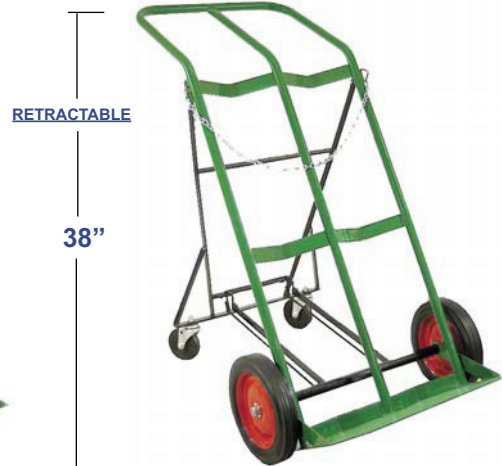
NO. 6214 HEIGHT: 46" DEPTH: 28" (O.D.) WIDTH: 25" (O.D.) WEIGHT: 41 lbs. WHEEL DIA: 10" x 1.75" SOLID RUBBER (BB) CASTER: 4" x 1" SWIVEL / POST DUAL CYLINDER