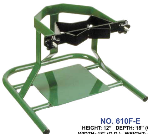
NO. 610F-E HEIGHT: 12" DEPTH: 18" (O.D.) WIDTH: 18" (O.D.) WEIGHT: 14 lbs.

THIS PATENTED STAND HOLDS A 7" TO 9 1/2" CYLINDER.