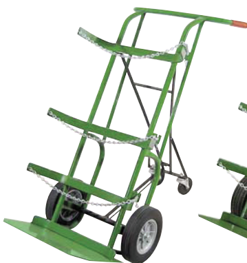
NO. 55-3B-FRA HEIGHT: 48" WIDTH: 21" (O.D.) WEIGHT: 50 lbs.

WHEEL TYPE: 10" x 2.75" SOLID RUBBER (BB)