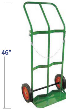
NO. 6210 HEIGHT: 46" DEPTH: 28" (O.D.) WIDTH: 25" (O.D.) WEIGHT: 31 lbs. WHEEL DIA: 10" x 1.75" SOLID RUBBER (BB) DUAL CYLINDER