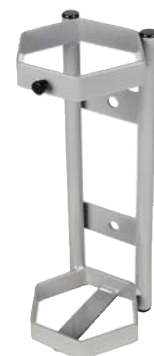
NO. 610WM-MRI HEIGHT: 14" DEPTH: 5" WIDTH: 5" WEIGHT: 4 lbs. HOLDS 1 (D/E)