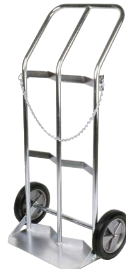
NO. 6210-CRU HEIGHT: 46" DEPTH: 15" WIDTH: 25" WEIGHT: 31 lbs. WHEEL DIA: 10" SEMI. PNEU. DUAL CYLINDER