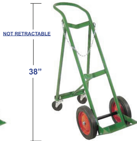
NO. 6114-R HEIGHT: 46" DEPTH: 28" (O.D.) WIDTH: 15" (O.D.) WEIGHT: 30 lbs. WHEEL DIA: 10" x 1.75" SOLID RUBBER (BB) CASTER: 4" x 1" SWIVEL / POST SINGLE CYLINDER