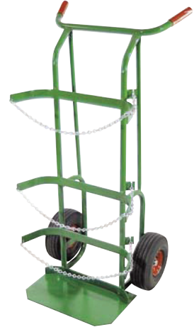
NO. 55PN-3B HEIGHT: 48" WIDTH: 25" (O.D.) WEIGHT: 37 lbs.

Designed and balanced to transport (2) 244 to 330 cu. ft. high pressure cylinders on a daily basis, the carts below are equipped with rear assemblies that relieve the operator from the heavy load. Four popular models are available to accommodate your delivery needs.