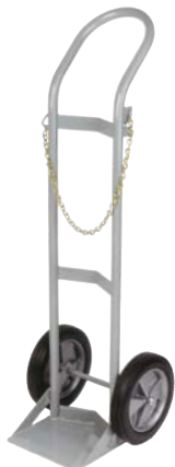
NO. 6110-MRI HEIGHT: 46" DEPTH: 15" WIDTH: 15" WEIGHT: 23 lbs. WHEEL DIA: 10" SEMI PNEU. HOLDS 1 (H or T) CYL.

These all stainless highly durable carts and mounts are painted white & have been tested inside a Phillips 1.5 Tesla Magnet (MRI unit in a major California hospital) with no attraction or disturbance to the coil.