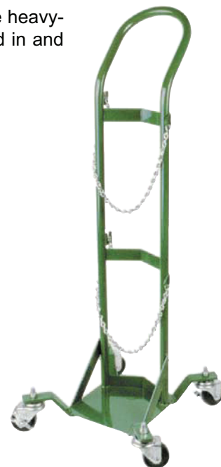
NO. 610FW-H HEIGHT: 48" DEPTH: 18" (O.D.) WIDTH: 18" (O.D.) WEIGHT: 25 lbs.

THESE MODELS ARE EQUIPPED WITH HEAVY-DUTY 3" x 1.50" REMOVABLE CASTERS W/ BRAKES