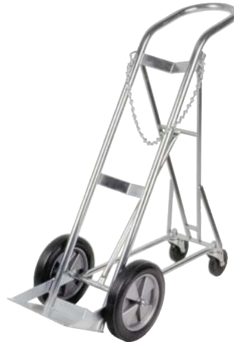
NO. 6114R-CRU HEIGHT: 46" DEPTH: 28" WIDTH: 15" WEIGHT: 30 lbs. WHEEL DIA: 10" SEMI. PNEU. STATIONARY REAR ASSEMBLY