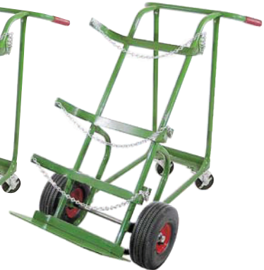
NO. 55PN-3B-SA HEIGHT: 46" WIDTH: 25" (O.D.) WEIGHT: 54 lbs.